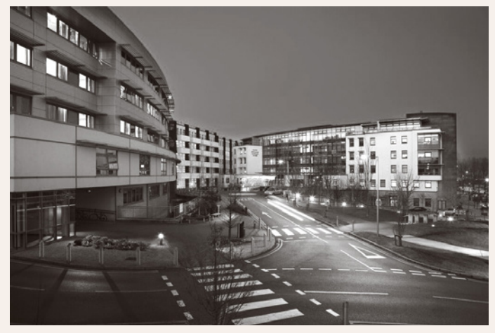
Cork University Maternity Hospital

There are four maternity units in our Group, namely Cork University Maternity Hospital (CUMH), University Hospital Waterford, Kerry General Hospital and South Tipperary General Hospital. A number of obstetric and gynaecology clinics also operate in the region.