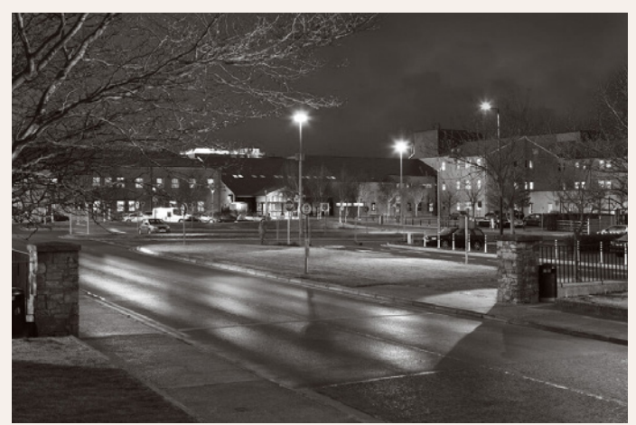
University Hospital Waterford