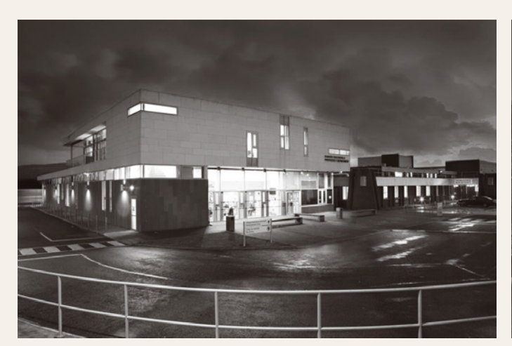
Kerry General Hospital