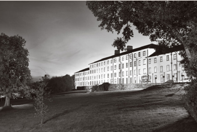
South Tipperary General Hospital